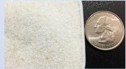
SchabelTech Prism SM 1525

SchabelTech Prism SM 1525 Low Cost Additive is a very efficient filler material used as a pigment extender to decrease the cost of formulated systems. Benefits may include: